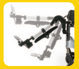
ELR / ALR

Folds compact for convenient transport and locks when unfolded for superior rigidity.