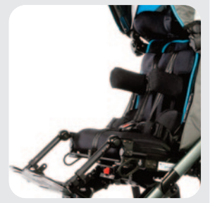
Voyage Advanced Seating (shown above)

Designed for children with mild to moderate positioning needs. Offers soft, adjustable components and polka dot upholstery.