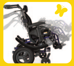
55° of Rotation-in-Space Technology

For superior positioning, the shortest possible wheelbase, and a smooth tilting motion.