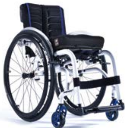
XENON² HYBRID THE STRONGEST