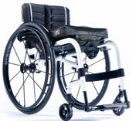
XENON² FF THE LIGHTEST