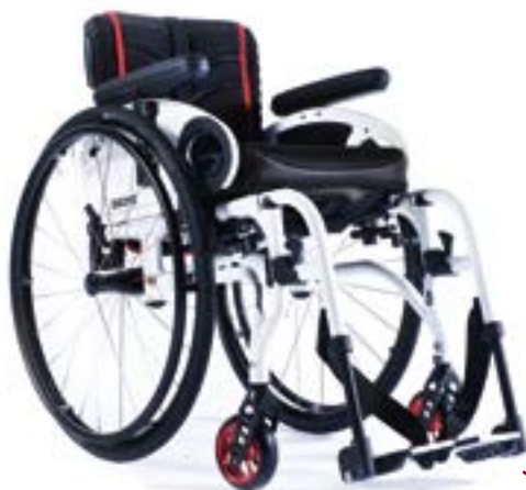
XENON² SA THE ALLROUNDER