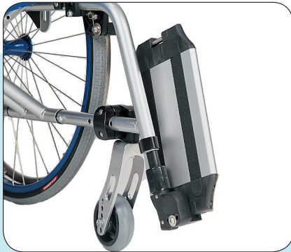
Flip-up (option 2119) and swing-away foot-plate (option 2117)