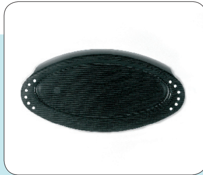
Side guard with cloth protector