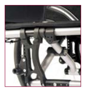
Simple seat height adjustment with preset factory "centre of gravity" settings