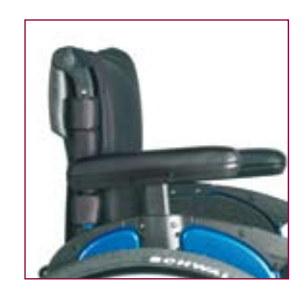
Wide range of sideguards and armrest options