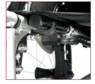
Internal cross-brace ensures optimum rigidity and drive performance