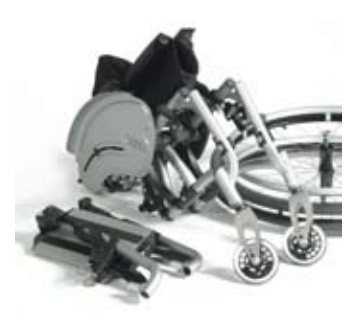
Fast folding frame and back with quick release legrest ensures convenient transportation