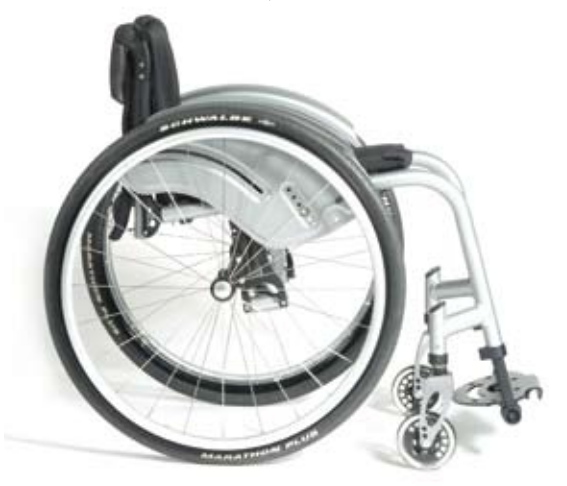
Modern open frame design (Fixed Front)

3.7 million colour combinations including 6 upholstery colours and 27 brilliant and matt paint finishes for your frame, hubs, forks, wheels, handrims and footplates.