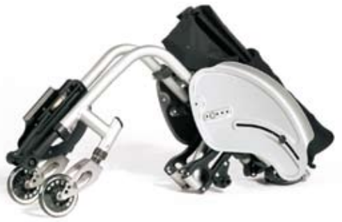
small folding (Fixed Front)