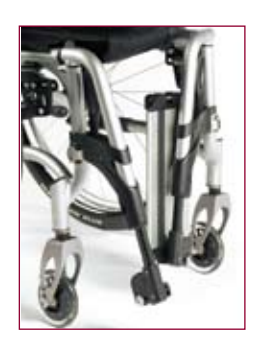
Neon Swing Away: with Swing-In and Swing-Out Function