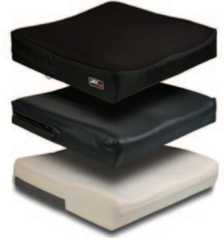
Ion® E2607, E2608 Up to 500 lbs.