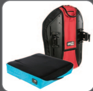
Turquoise cushion cover and University Red back cover