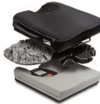
J3® E2622, E2623, E2624, E2625 Up to 500 lbs.