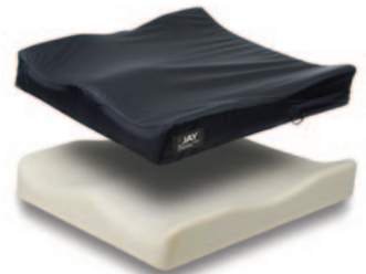
Basic PRO® E2601, E2602 Up to 500 lbs.