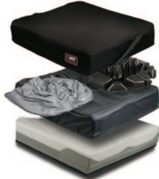
Fusion® E2622, E2623 Up to 500 lbs.