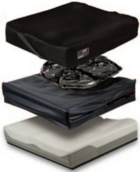
Fusion® with Cryo™ Technology E2622, E2623 Up to 500 lbs.