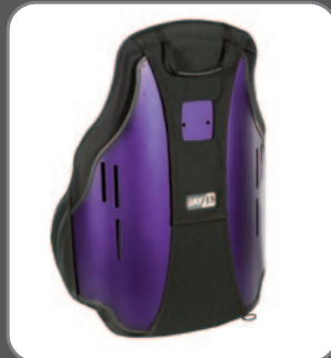
Matte Purple painted back shell