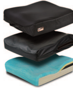
Union® E2607, E2608 Up to 500 lbs.