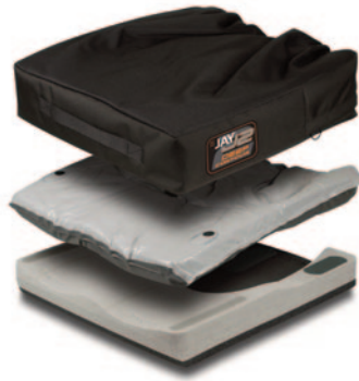
J2® Series E2622, E2623, E2624, E2625 Up to 500 lbs.