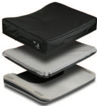
J2® Plus K0669 Up to 650 lbs.